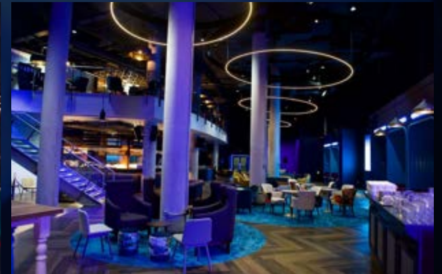
The O2 Blueroom