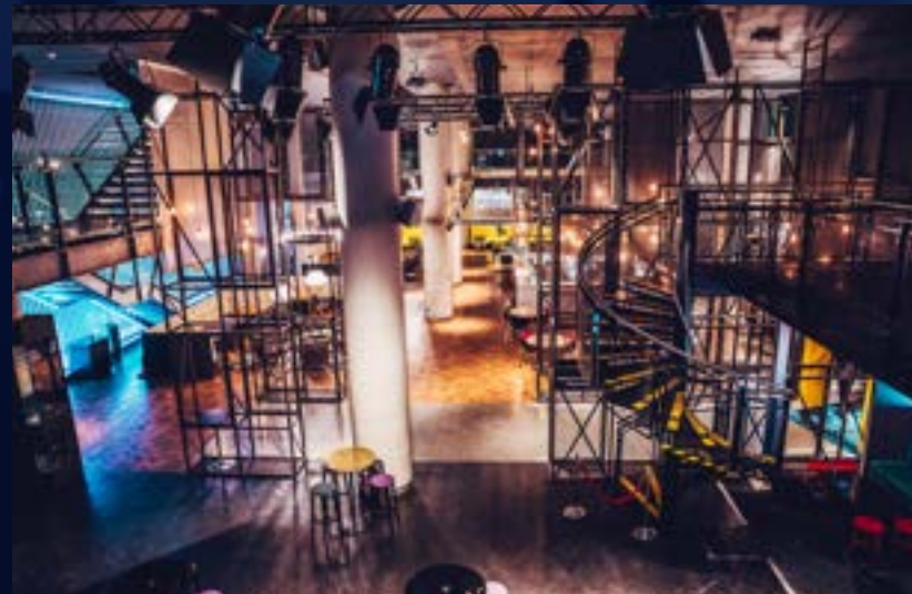
AMEX Lounge The O2