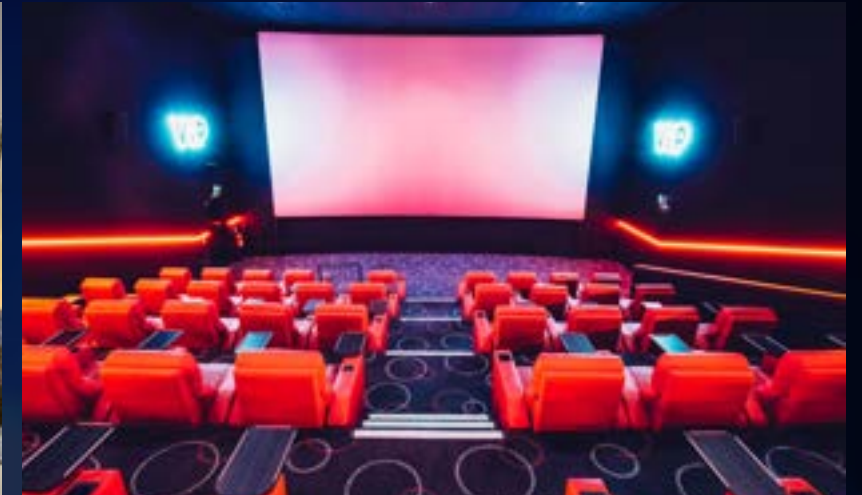
Cineworld The O2