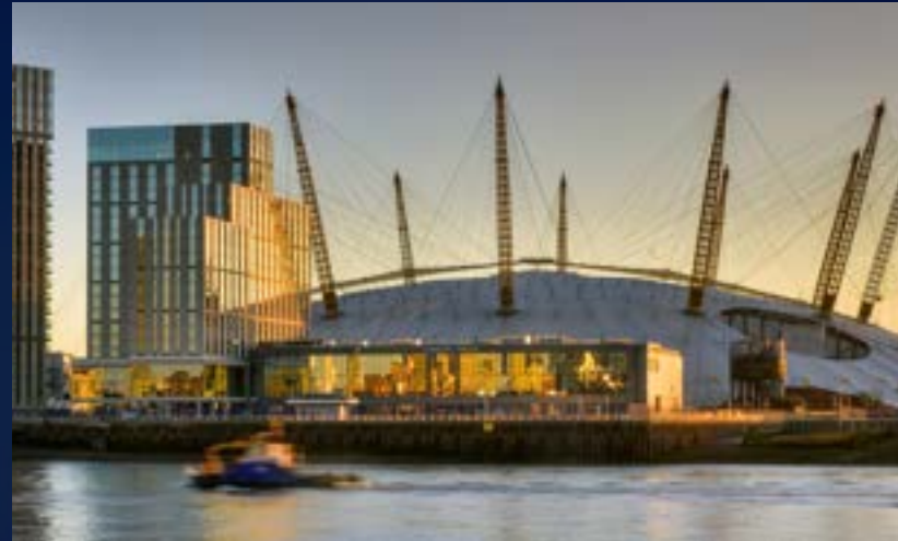
The InterContinental London The O2

Used as a lounge space for O2 customers attending shows at The O2 arena the venue works well for standing receptions or a breakout space. Capacity: 350 drinks reception, 200 theatre style